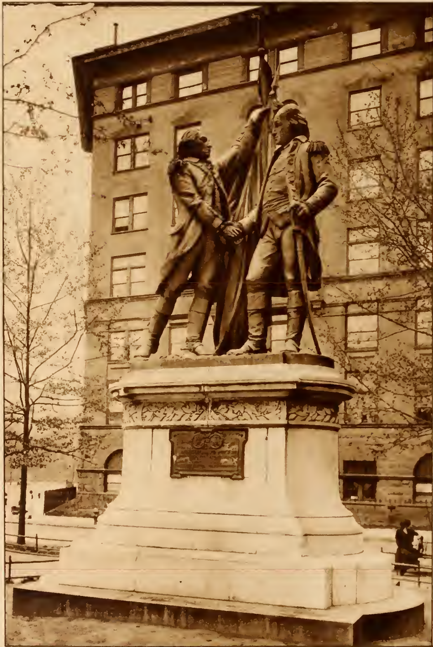
STATUE OF WASHINGTON AND LAFAYETTE, in memory of services rendered by France's illustrious soldier at the time of the Revolutionary War.